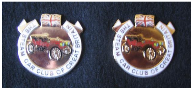
Silver PINS Gold $5 ea.