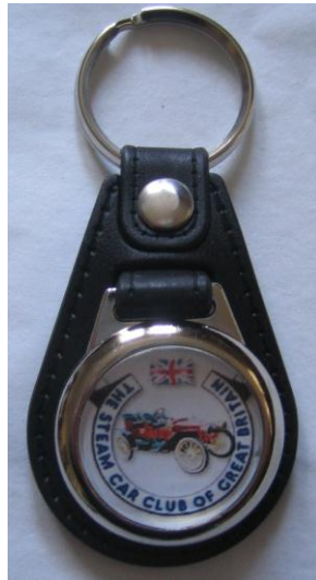
Key Rings - $8